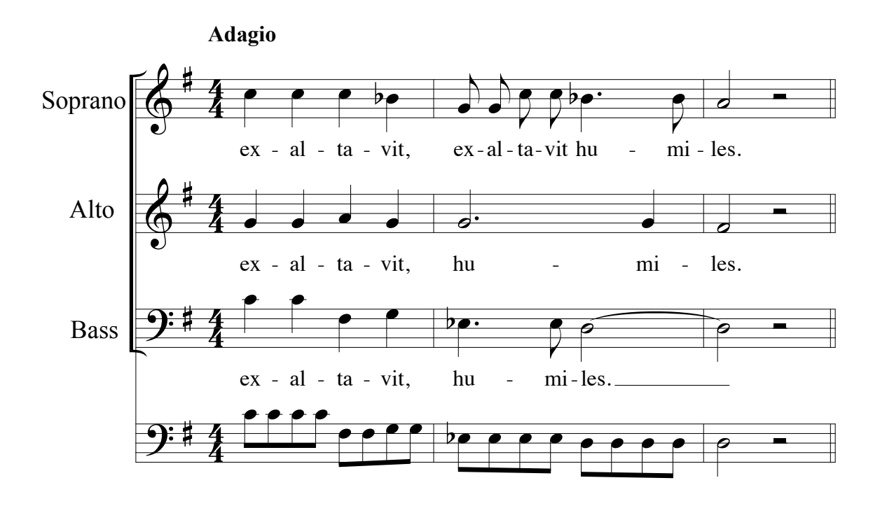
Figure 5: Giovanni Porta, Primo Magnificat Piena, mm. 103-105

In Porta's Primo Magnificat , the setting of line 7 ("Deposuit potentes de sede: et exaltavit humiles") is notable for its texture. (See Figure 4.) While all other sections feature harmonies of thirds and sixths and are interspersed with contrapuntal melodies, this text is set in unison tutti. Within the entire Magnificat setting, this text stands out from among the rest. Additionally, the composer chose to repeat the words "exaltavit humiles" in a three measure long Adagio section, enclosed between rests. (See Figure 5.) The repetition, while suddenly changing the tempo, emphasizes this text even more.