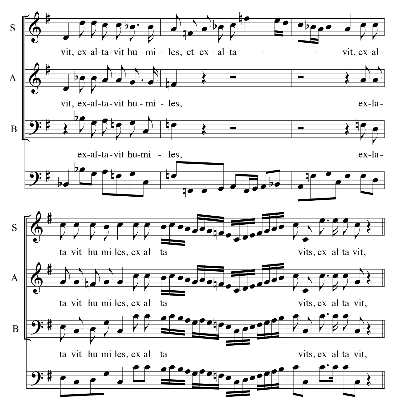
Figure 4: Giovanni Porta, Primo Magnificat Piena, mm. 92-102