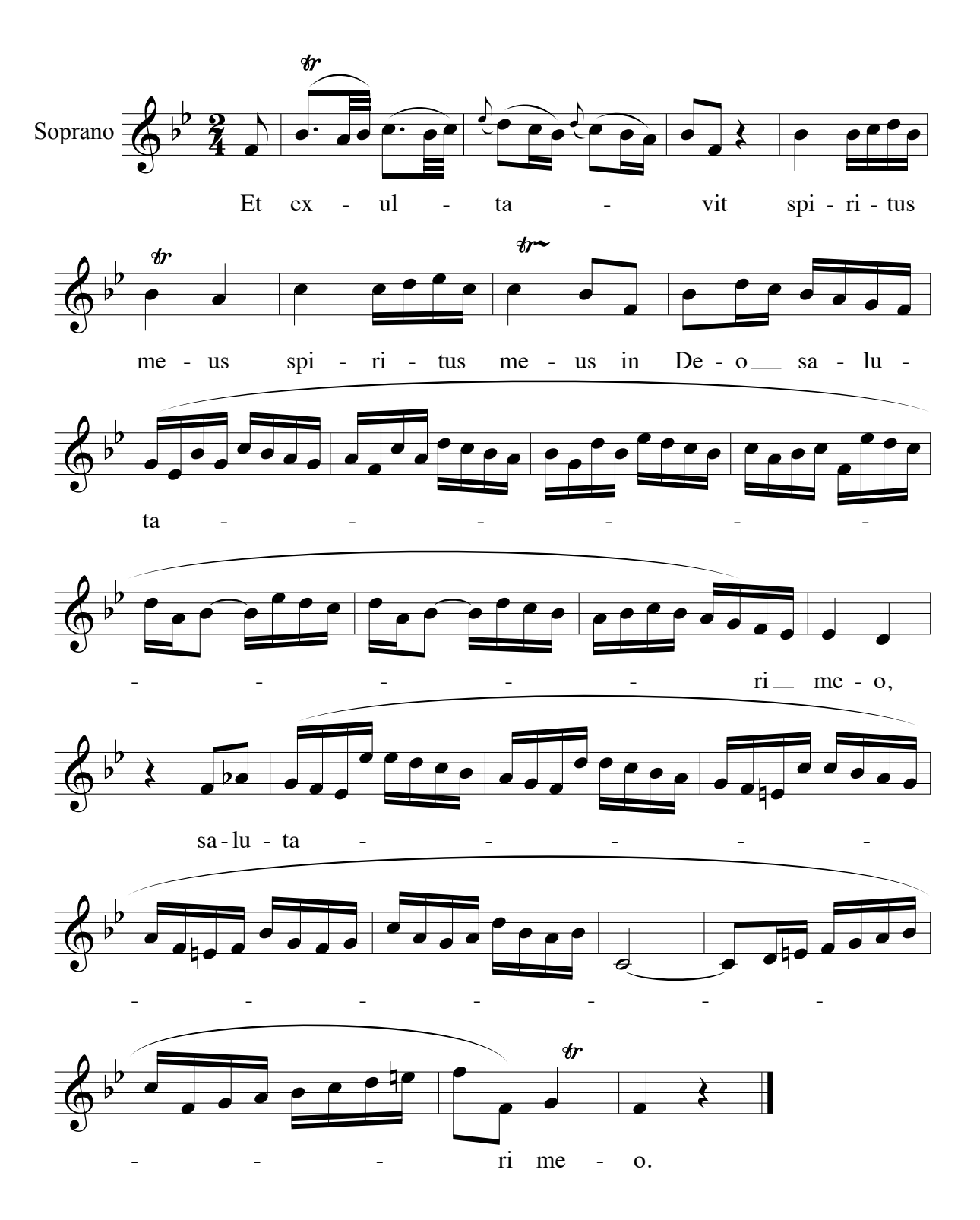
Figure 2.2: Antonio Vivaldi, Magnificat RV 611, Second Movement, solo soprano, mm. 11-37