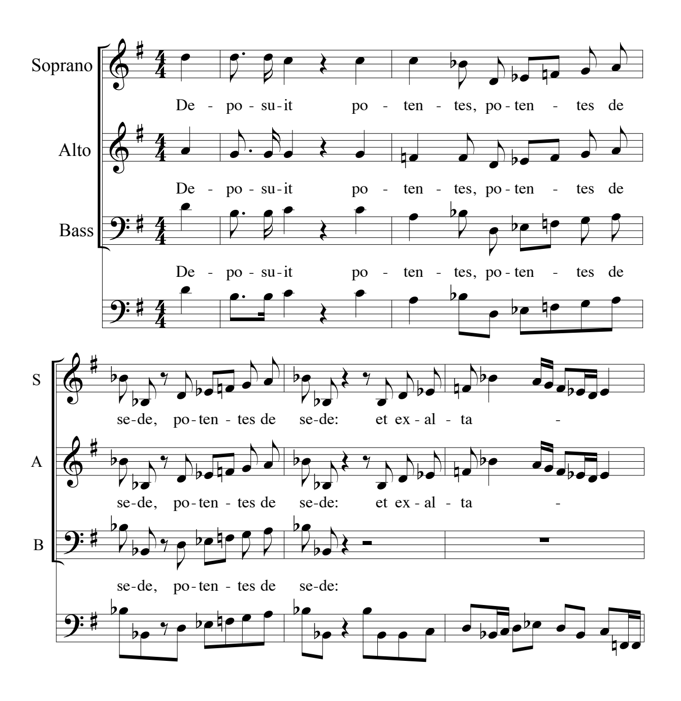
Figure 4: Giovanni Porta, Primo Magnificat Piena, mm. 92-102