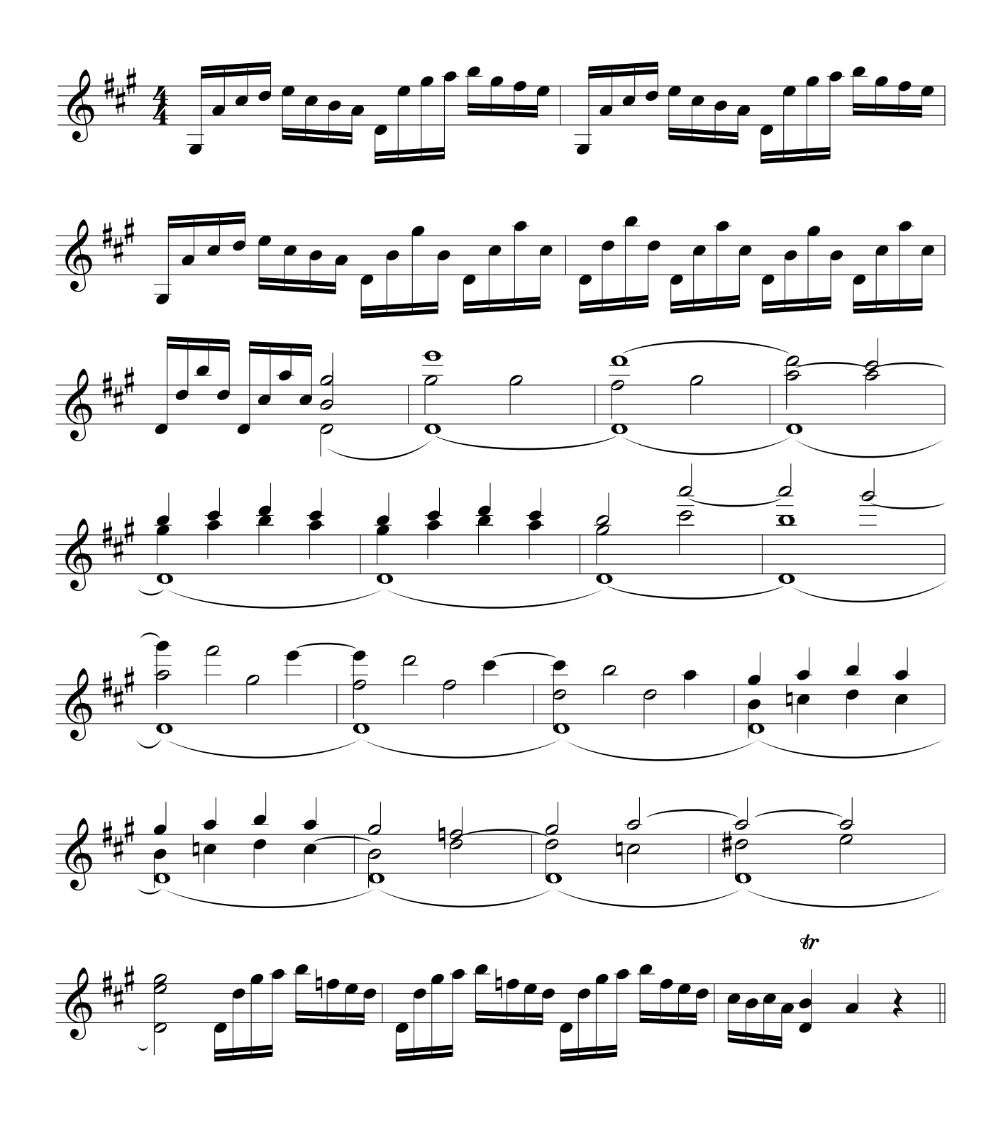
Figure 1: Antonio Vivaldi, Violin Concerto RV 343, solo violin, cadenza, mm.79-101