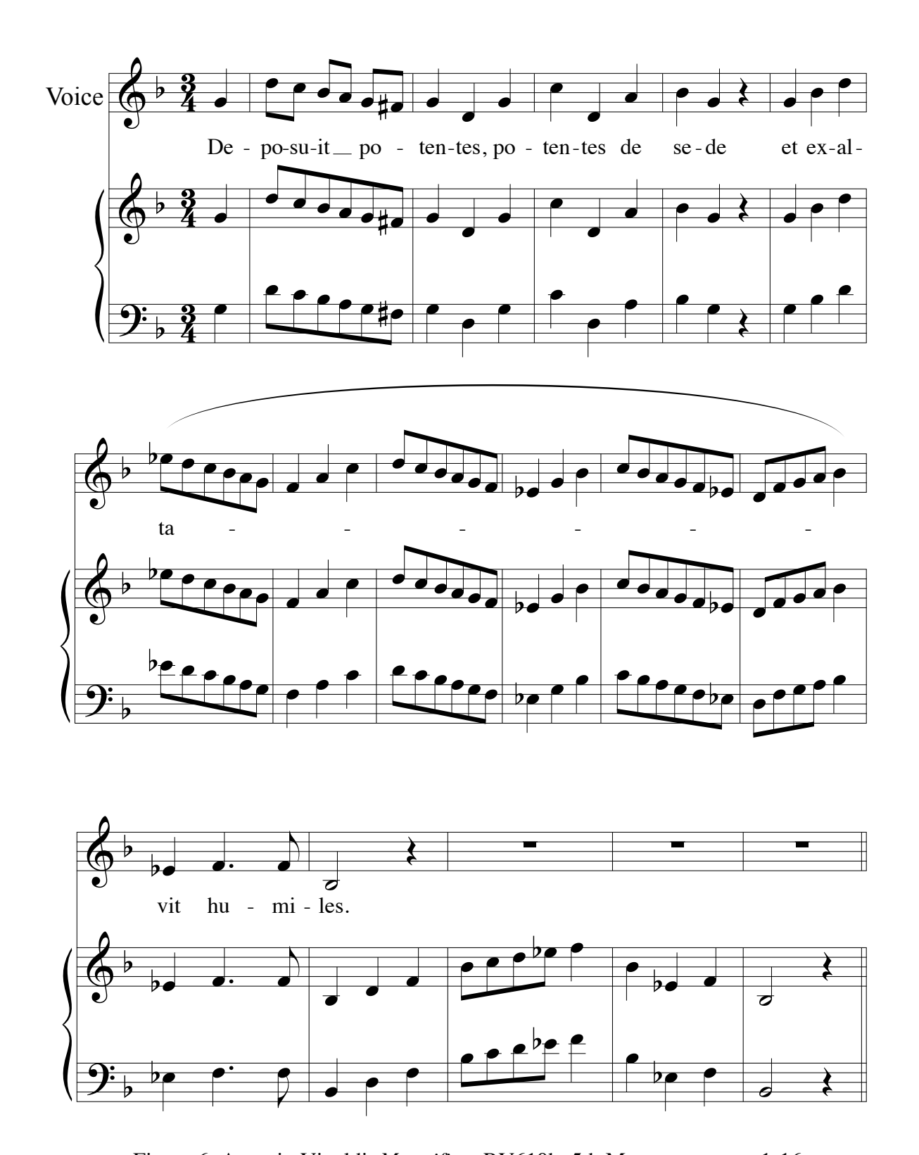
Figure 6: Antonio Vivaldi, Magnificat RV610b, 5th Movement, mm. 1-16